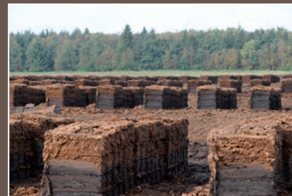
Negative impacts have to be minimised during excavation process

The quintessence of the RPP Certification and the required processes are explained in www.responsiblyproducedpeat.org .