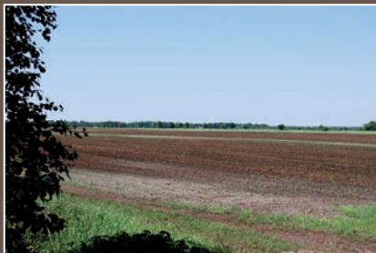
Degraded peat bogs are preferred for RPP Certification

Due to a long-term experience in peat excavation, restoration and rewetting of peat bogs, Hofer & Pautz GbR is offering support in application to RPP Certificate.